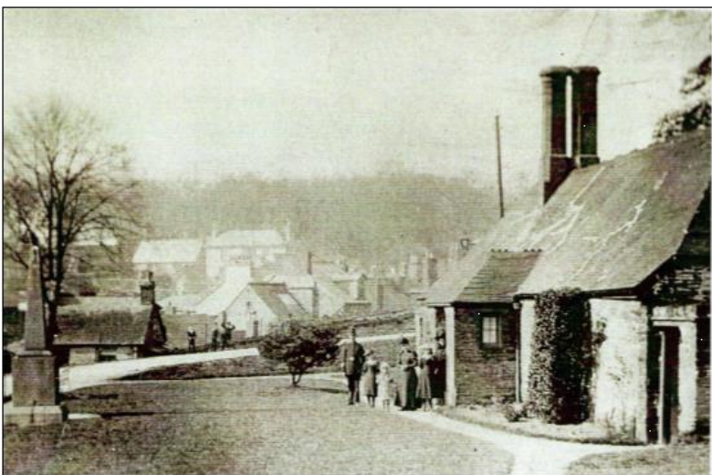
The Old Police House

Probably the most famous pupil at the school was the Reverend Stephen Hawker. In 2007 the BBC broadcast a programme about Hawker being the creator of the Harvest Festival. Hawker is also credited with publishing the words to the unofficial Cornish anthem 'Trelawny'. By 1856 the school had been converted into a prison and policeman's house and an annual rent of £3 was paid to the Duchy.