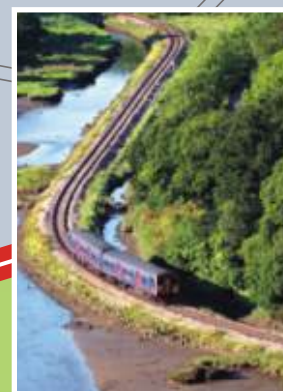
Looe Valley Railway Line