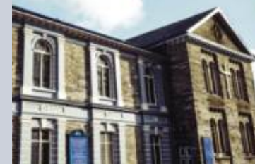
Liskeard Methodist Church

Follow local heritage trails to discover the distinctive architecture of Henry Rice and visit the ancient Pipe Well, the probable origin of the town.