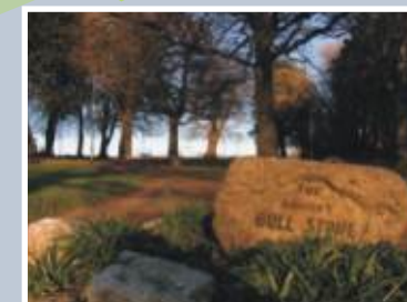
The Bull Stone, Castle Park