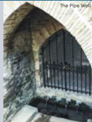
The Pipe Well