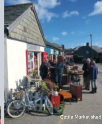
Cattle Market sheds

For details of shops and cafés see www.yourliskeard.co.uk