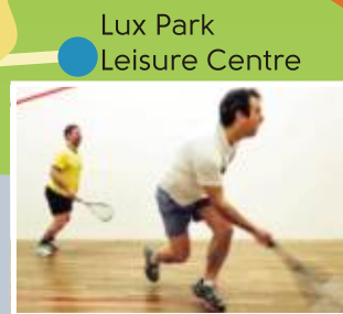
Lux Park Leisure Centre